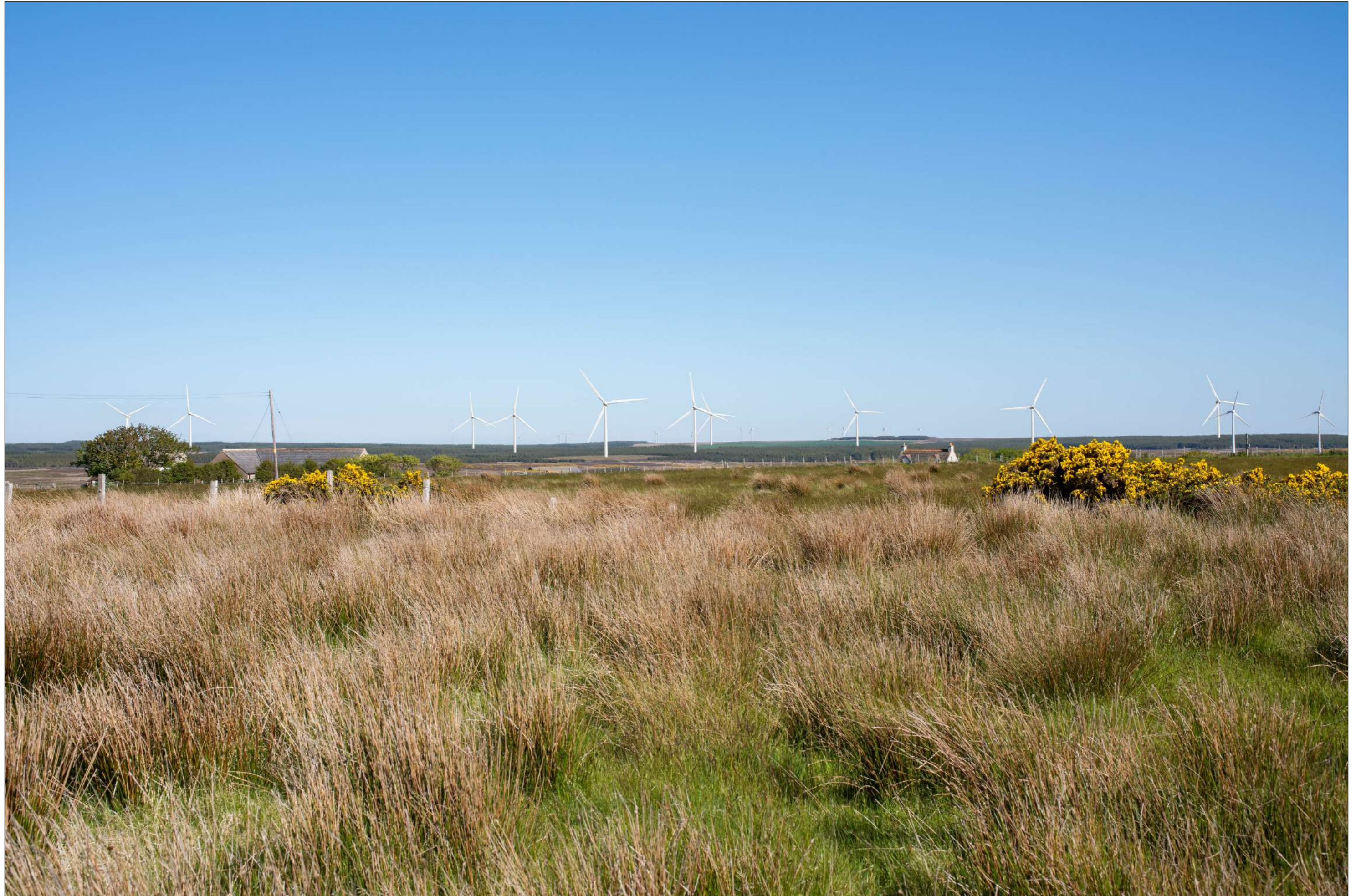
Figure: 7.21-THC-03 Viewpoint 8: Barrock

When viewed at a comfortable arm's length (approx. 500 mm), this printed image is representative of our detailed central vision, but is not representative of scale and distance.