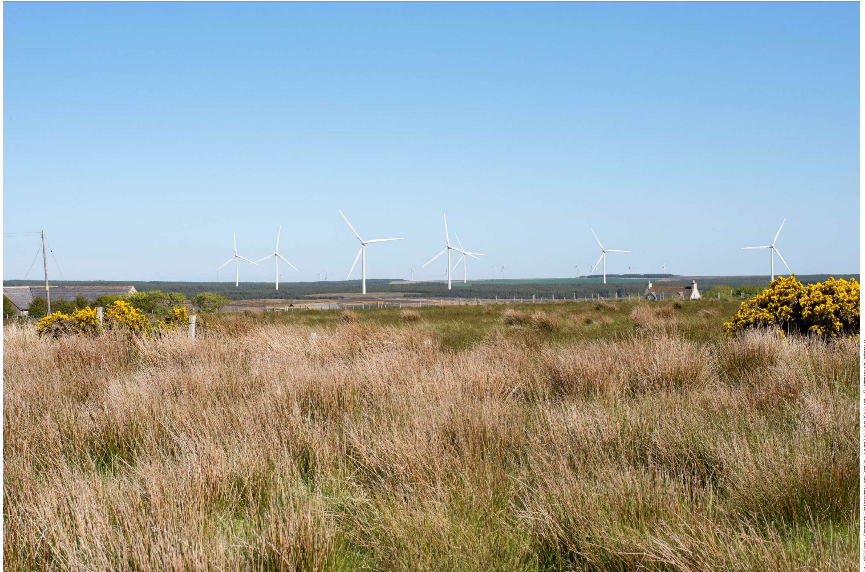
Figure: 7.21-THC-04 Viewpoint 8: Barrock

This image should be viewed at a comfortable arm's length (Approx. 500 mm)